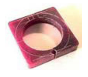
Step 4: Cut 3 square edged pieces of the hinge wax, making one piece 2 mm and the other two about 3 mm each. Slide the three pieces onto a drill shank, with the 2 mm. one in the center.